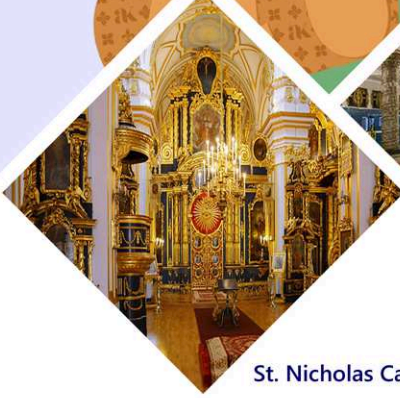
St. Nicholas Cathedral