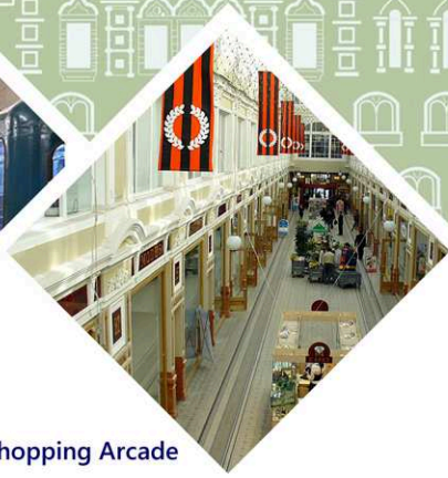
The Passage Shopping Arcade